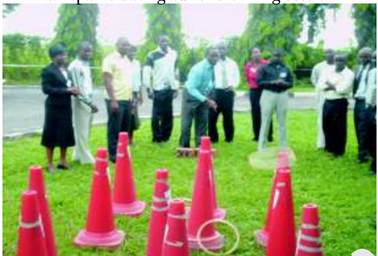
Participants undertaking their simulation exercise

To be part of our various workshops and other programs contact: democraticleadership@africaleadership.org