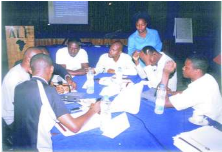
Participants during a brainstorming Session

Evaluations of short term results generated from the assessment forms filled by participants at the end of the workshop indicated great achievements. This group of the DLTW formulated projects for organized inputs into governance process. While a number of positive spiral developments were visible from the workshop.