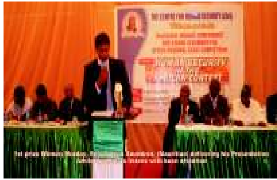
Presentation Ceremony held at the Presidential Library Complex on the 5th of March 2009.

The 1st Africa Wide Essay Competition on "Young people's Perception of Human Security in Africa" organised for the Centre for Human Security of the Olusegun Obasanjo Presidential Library by the Africa Leadership Forum officially came to a close at the Prize