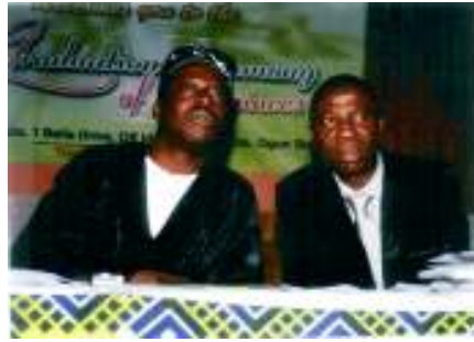
The Project Director and Project Coordinator at EDC Graduation Ceremony

T he ALF/CBN Entrepreneurship Development Centre recently held its maiden graduation for about 250 entrepreneurs.